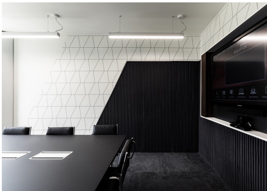
MILANO Architect Il Prisma Client AON Headquarter