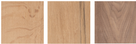
Quarter White Oak